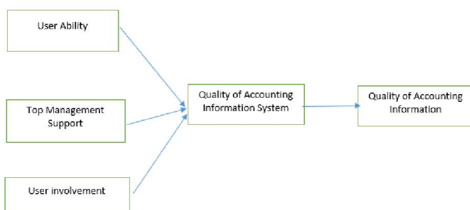
Figure 1. Theoretical Framework of the Study

Based on the theoretical frame work have just described, then the theoretical framework is as below: