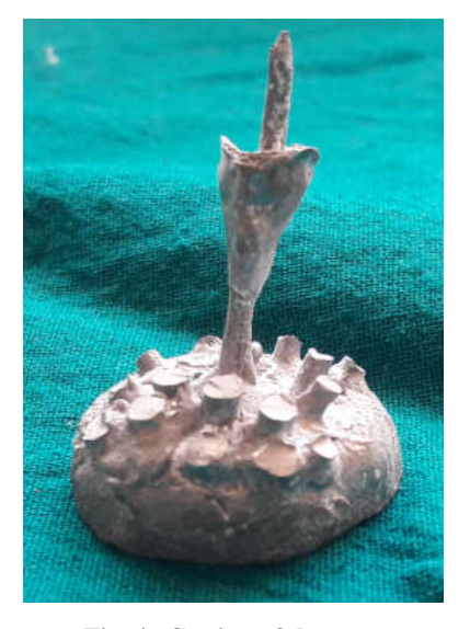
Fig. 4. Casting of the post