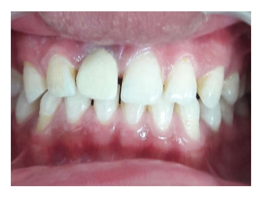
Fig. 6. Final cementation of the ceramic crown