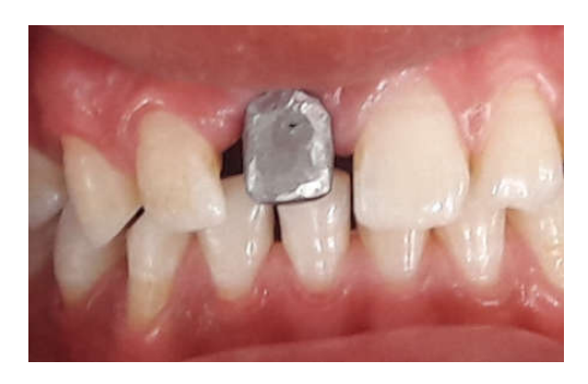
Fig. 5. Try in of the casting