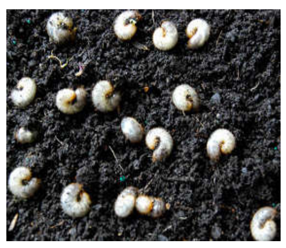
Figure 1. White-Curl grub (Phyllophagaspp) larva

Three harvest frequencies were applied including two cutting time at 5, and 10 months; and a single harvest at root-tuber harvesting.