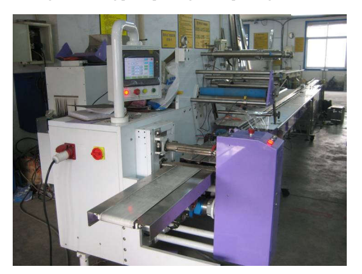
Fig. 3. Physical drawing of packing machine

Design of control function: The key component of the control system is the cooperation between the upper computer control terminal and the lower computer processor. According to the structural characteristics of the packaged parts, the staff set the relevant process sizes on the upper computer, such as initial process parameters, later parameter modification, working status display, fault information warning, packaging quality detection data, etc. When the control system works, it is necessary to check the existence of each sensor, that is, initialization. After initialization, the instruction of skipping ROM is sent, then the instruction of reading register is sent, and the reset pulse is sent to DSP56800. After receiving the signal, the DSP begins to record the parameter values, and finally gets the final accurate measurement data through CRC The system sets parameters such as verification. communication port, baud rate and stop bit length at the communication port to control the closing and closing attributes of the serial port.