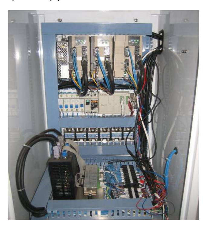
Fig. 1. Physical drawing of electric control system

When the three-servo packaging machine is working, the user sets the working requirements and working conditions of the packaging. The process is realized by the upper computer control terminal. The transmission parts of the packaging machine work, such as the triaxial coordinated motion of the transverse seal shaft, the plastic composite film shaft and the material groove shaft. Each packaging link has good synchronization, which is realized by the lower computer. This is also the core part of the whole control system, and the process has strict standardization. According to the control requirements of the transmission system of the three-servo packaging machine, the object-based control scheme is adopted in this paper.