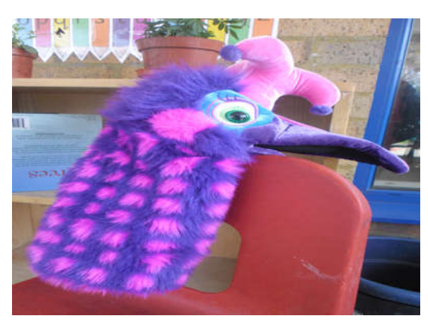
Photograph B shows a picture of the puppet used in this study