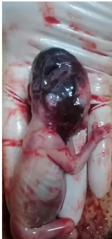
Figure 2. Macroscopic Appearance of a Fetus with Cystic Hygroma

Prenatal ultrasound diagnosis relies on demonstrating a septated or non-septated bilateral cystic lesion in the fetal occipitocervical region in both sagittal and axial planes. Aneuploidy, notably trisomy 21, trisomy 18, and Turner syndrome, are the most common chromosomal abnormalities associated with first-trimester cystic hygroma. Aneuploidy occurs more frequently in septated cases, ranging from 29% to 65% of affected fetuses in different studies.(6),(7). Cystic hygroma is associated with a very poor perinatal prognosis. Scholl and Durfee (2012) demonstrated that neck thickness correlates strictly with the risk of an unfavorable prognosis: each 1 mm increase in cystic hygroma thickness increases the risk of chromosomal abnormalities by 44%, congenital anomalies by 26%, fetal demise, intrauterine fetal death, or neonatal death by 47%, and overall unfavorable prognosis by 77% (8).