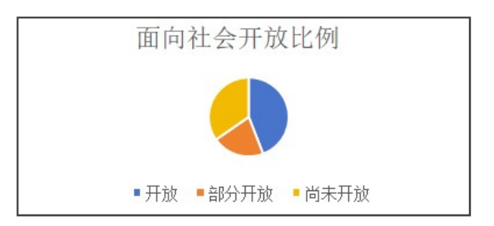
Figure 3. 1 Proportion of domestic venues open to the public

Inflexible use of venues: China's sports venues are managed by a number of industry systems, the subsequent supervision process will be corresponding problems, so in order to cope with the overall development of society needs to be adjusted. From the existing information, domestic stadiums are not flexible in the way they are open to the public, and in their management activities, they tend to put the needs of competitive games in the forefront, with relatively little regard for the needs of the community, making stadiums insufficiently open to the public. Research has shown (figure 3-1) that the overall openness of domestic stadiums to the community is about 44.1 per cent, with 21.30 per cent partially open and 34.60 per cent not yet open.